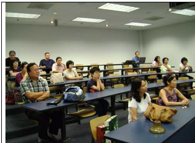
There were about 20 Chinese School parents, JCA members and interested individuals attending the talk of Music Education at JCA Chinese School on October 11, 2009.