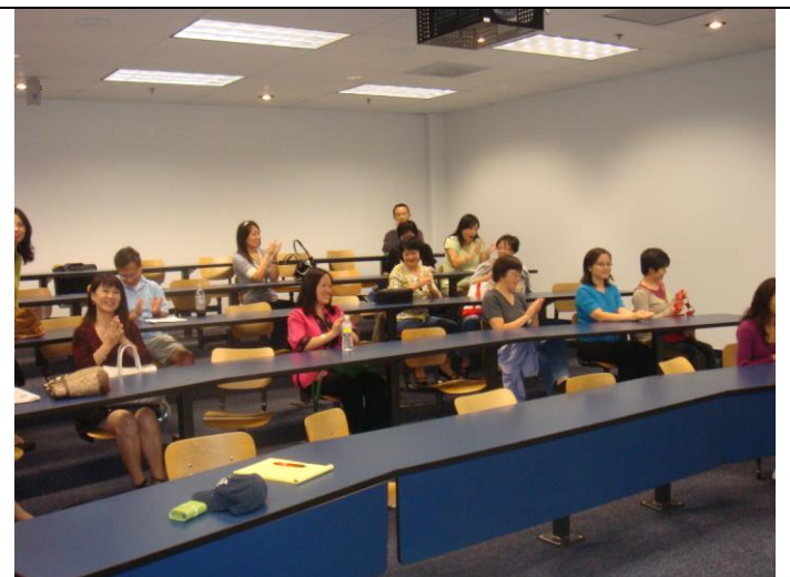
A well deserved applause from the audience to the guest speaker.