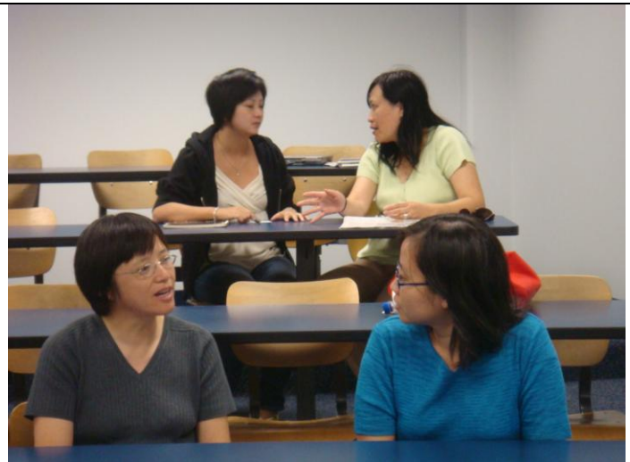
Parents are sharing their points of views